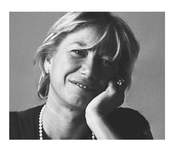
CARLOTTA DE BEVILACQUA

Architect, designer and above all humanist, Carlotta de Bevilacqua has been a force in contemporary lighting since the 1980's. A pioneer in LED research and implementation, she created the concept "The Human Light" in which lighting encourages not only the well-being of those who live, work and interact with it, but also the planet.