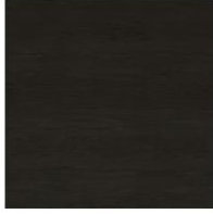
Veneered wood Coal oak