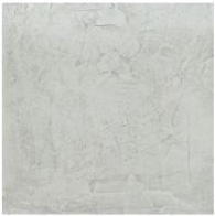
Concrete Travertin look