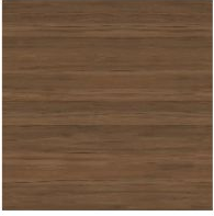
Veneered wood Walnut Canaletto